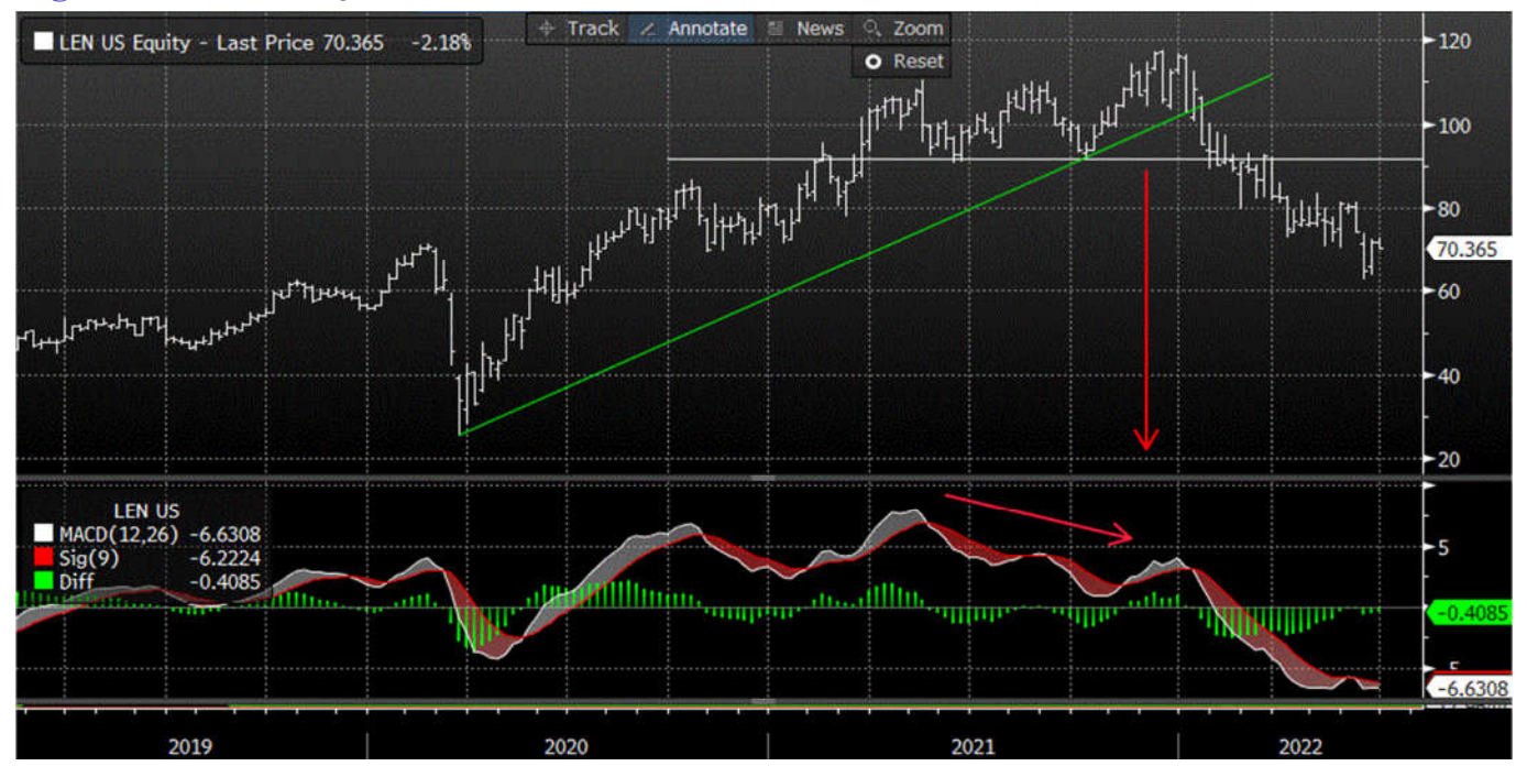
Fig. F-4 LEN (Weekly)