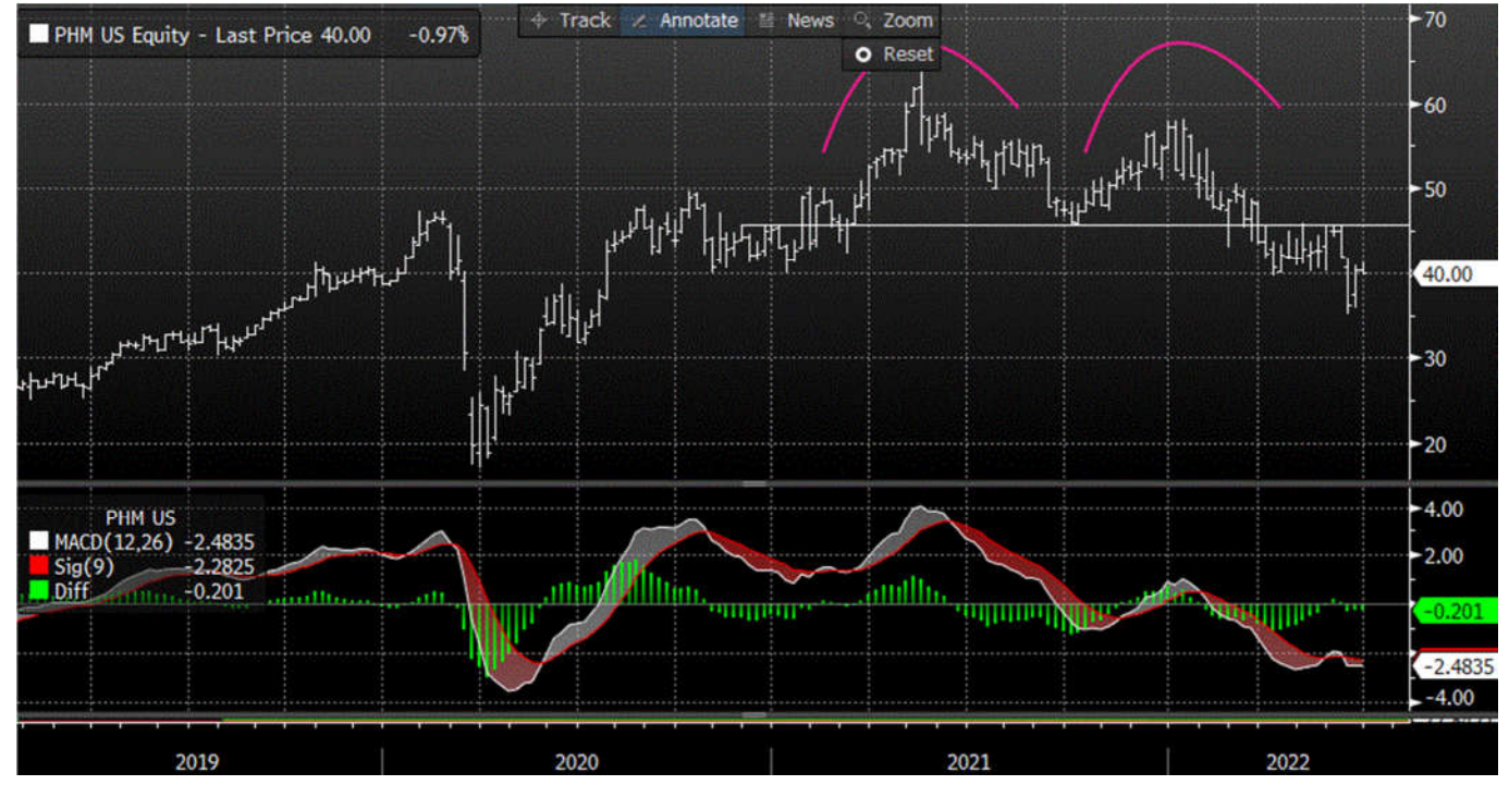
Fig. F-6 PHM (Weekly)

PHM has completed a double top ( Fig. F-6 , arcs), with no negative momentum divergence but with a monthly Sell following each top (separated by a temporary rally), followed by the break of horizontal support, a kickback rally into the support, now resistance, and the June 2022 new low. Given the prior technical patterns above, the decline may continue.