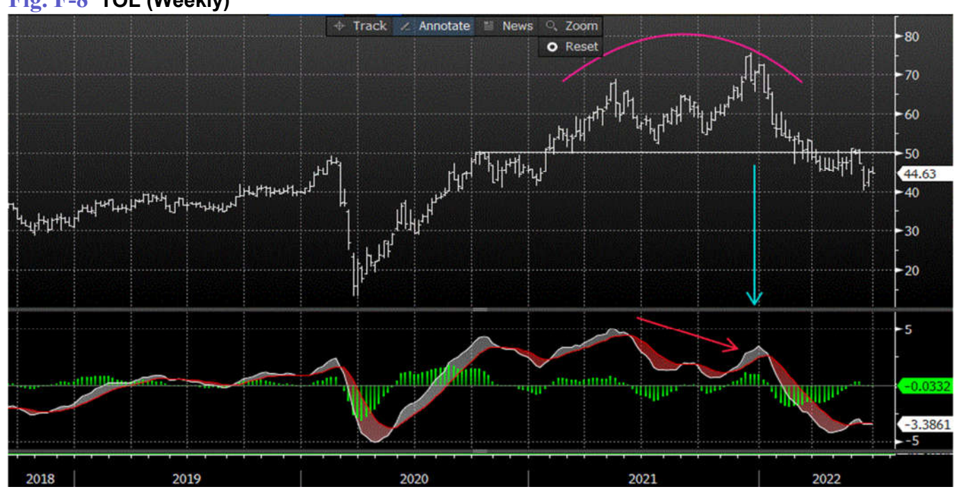
Fig. F-8 TOL (Weekly)