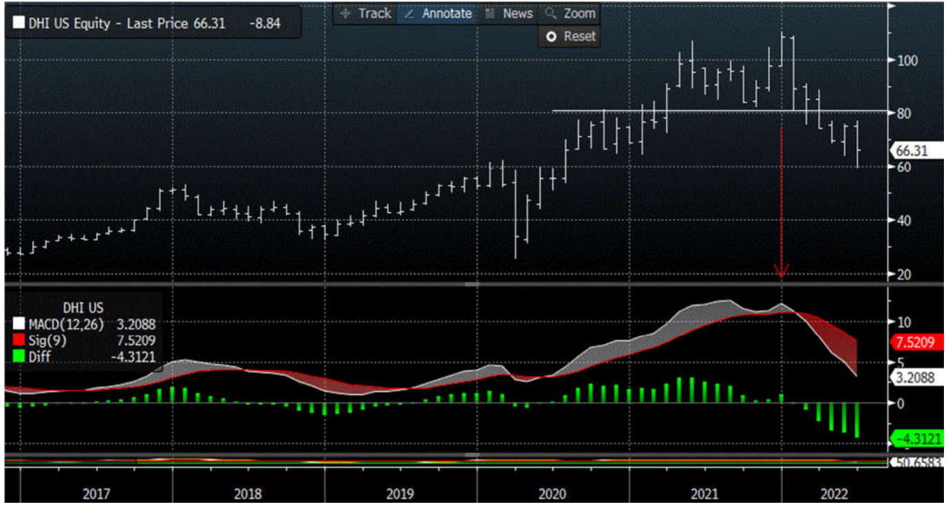
Fig. F-2 DHI (Monthly)

Granted, the Technology stocks were the initial market decliners, with the NASDAQ index leading down into bear market territory. But the Housing stocks' negative technical profiles suggest this market decline may have further to go, carrying the other major indexes similarly into bear market territory.